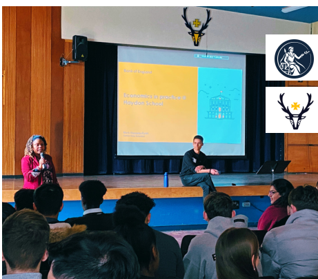
"Economics in Practice"