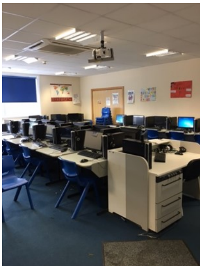
THE AUDIO LAB