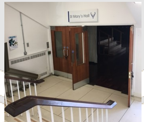
ST MARY'S HALL