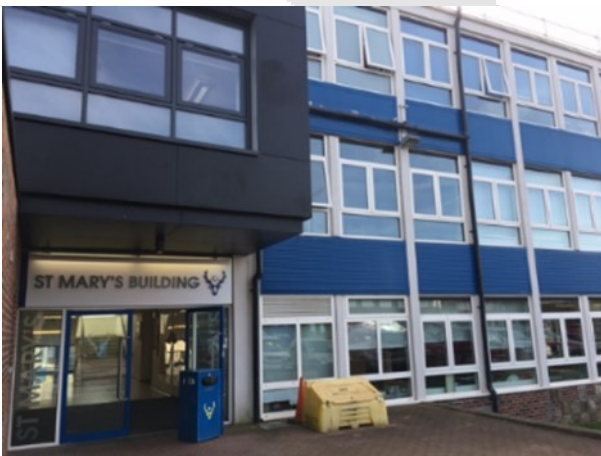
ST MARY'S ENTRANCE

Second Floor: English (20-28) Music (M1, M2 and M3)