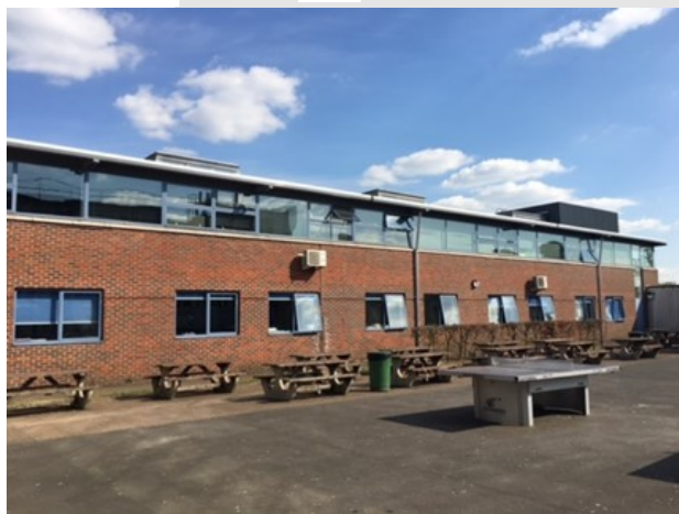
DOBSON BUILDING / THE QUAD