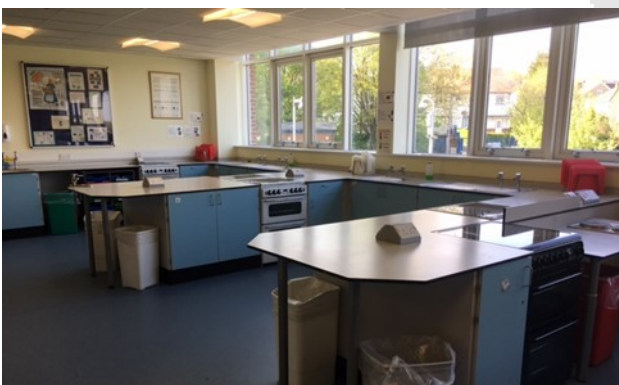
FOOD TECHNOLOGY CLASSROOM